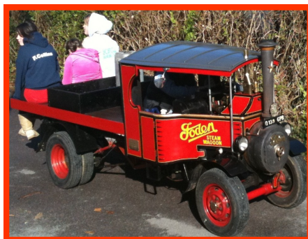
A big favourite at last year's threshing week-end.